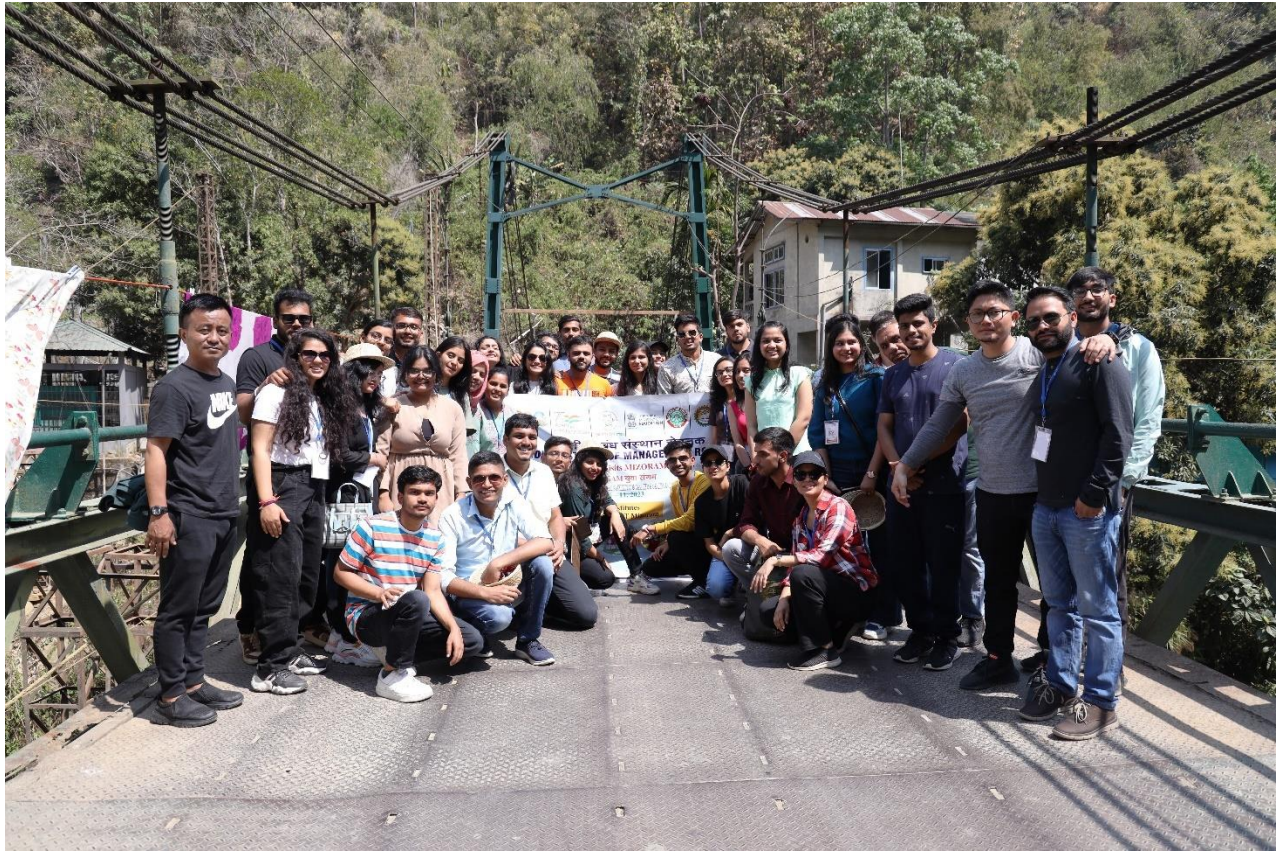
Reiek view point is at an elevation of 1465 m and a heritage village is located in the area showing the Mizo traditional homes.