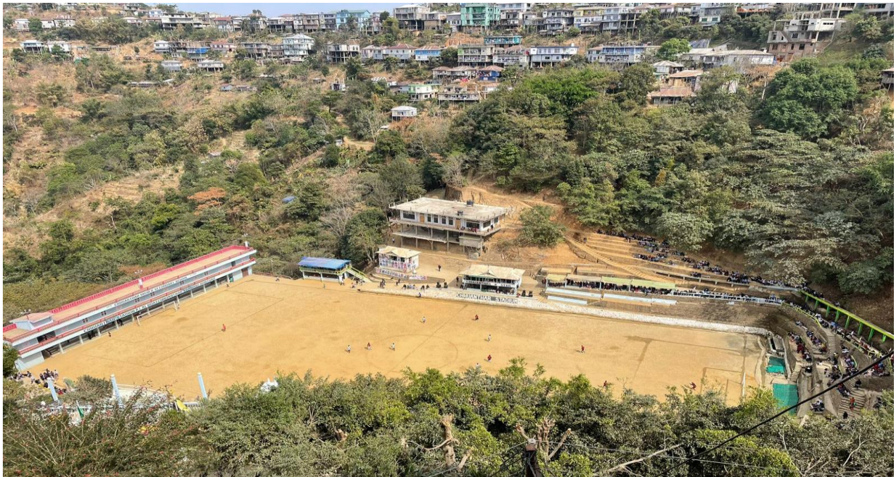
At Baktawng with World's largest family