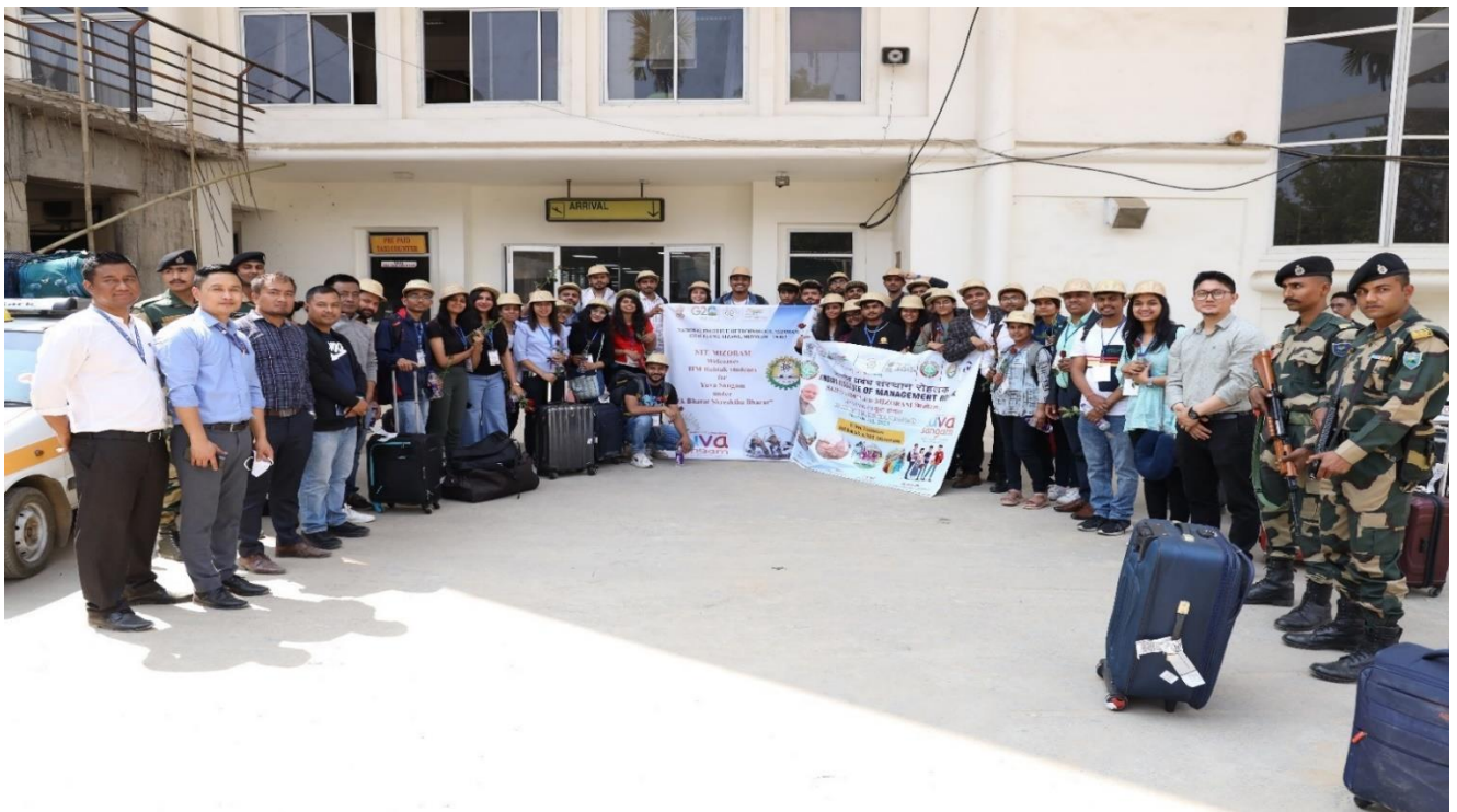
Team NIT Mizoram receiving team Haryana at Aizawl Airport