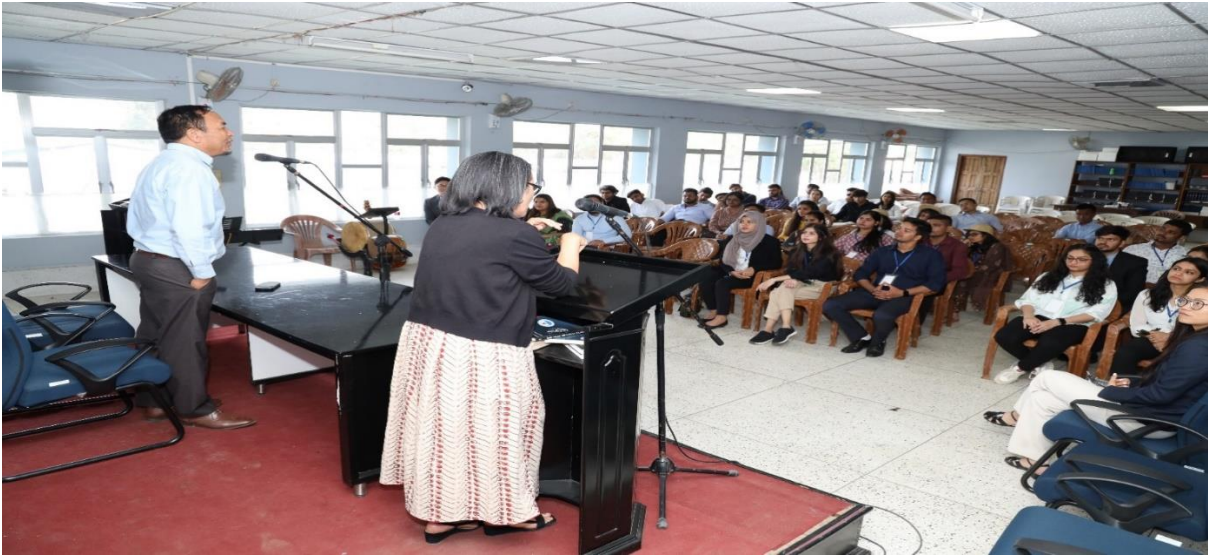
Interaction with the Principal and staff of ATC with the team Haryana

Day 4: Visit to Aizawl Theological College (ATC), K V Paradise, interaction with Chief Minister of Mizoram, and Cultural Evening cum Grand Dinner cum Farewell hosted by NIT Mizoram