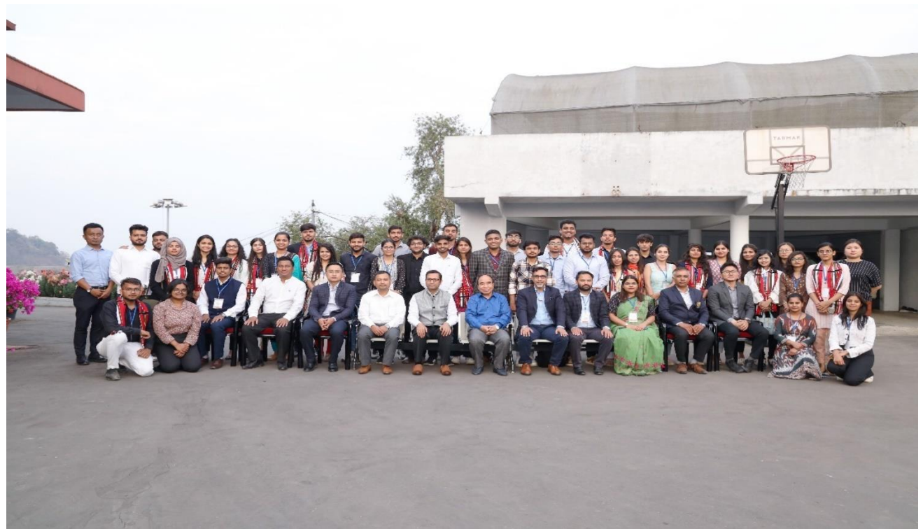
Interaction with Pu Zoramthanga, Chief Minister of Mizoram