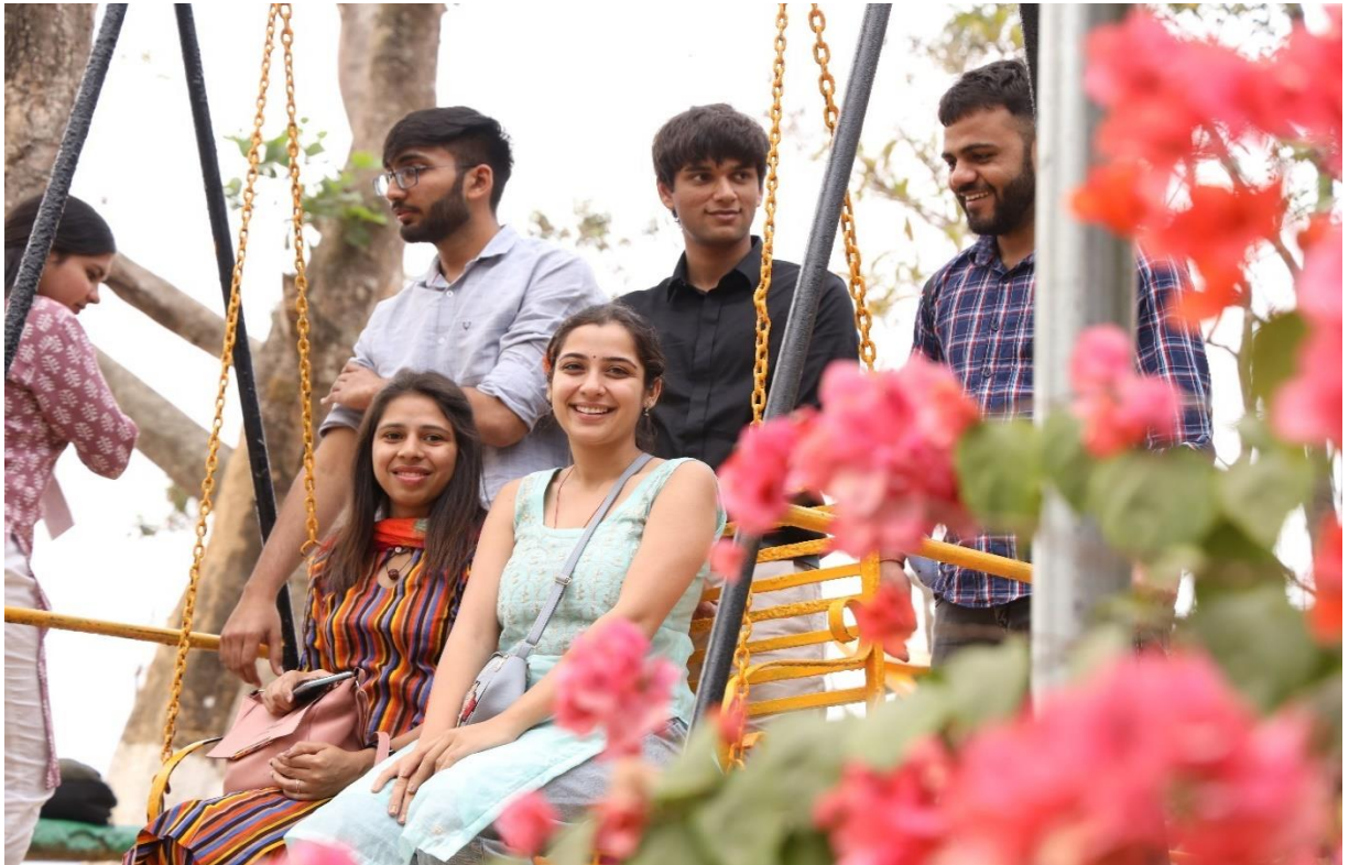
K V Paradise